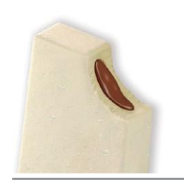
Banana with Nutella